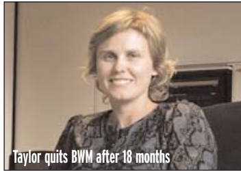
Taylor quits BWM after 18 months

The group recently struck a partnership deal with Sensis that will see a three-month project that will develop innovative mobile ads and boost consumer interaction with the medium.